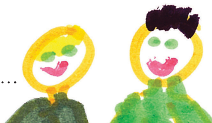
Artwork by 7-year-old girl whose father is living with cancer