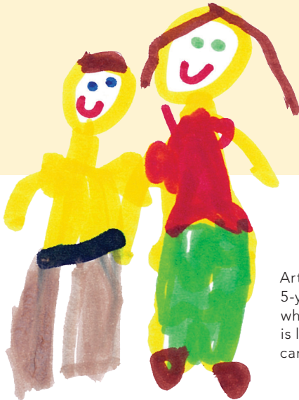
Artwork by 5-year-old boy whose father is living with cancer

“Magical thinking” : Thinking they did something to cause cancer (e.g., “I wouldn’t go to sleep and kept Mommy awake. She was very tired and I think I made her sick.”)