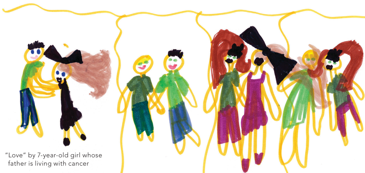
"Love" by 7-year-old girl whose father is living with cancer

66% OF PARENTS ANSWERING A CANCER SUPPORT COMMUNITY SURVEY SAID THAT THEIR CHILD(REN) DID NOT TALK OPENLY WITH THEM OR SHARE THEIR FEELINGS ABOUT CANCER.