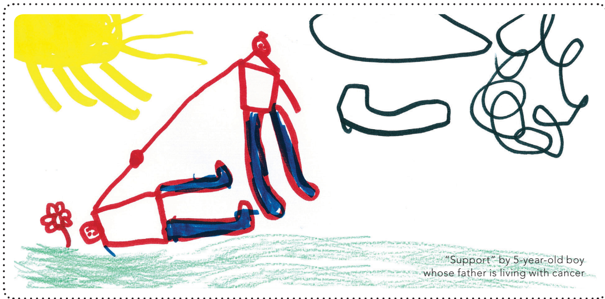
"Support" by 5-year-old boy whose father is living with cancer.